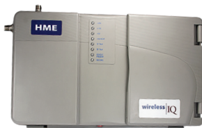
HME 6000 BASE STATION

Following are the programming instructions for your HME ION headset and HME 6000 base station.