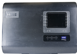
HME ION BASE STATION

Following are the programming instructions for your HME ION headset and HME ION base station.