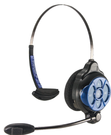
HME ION 6100 ALL-IN-ONE HEADSET